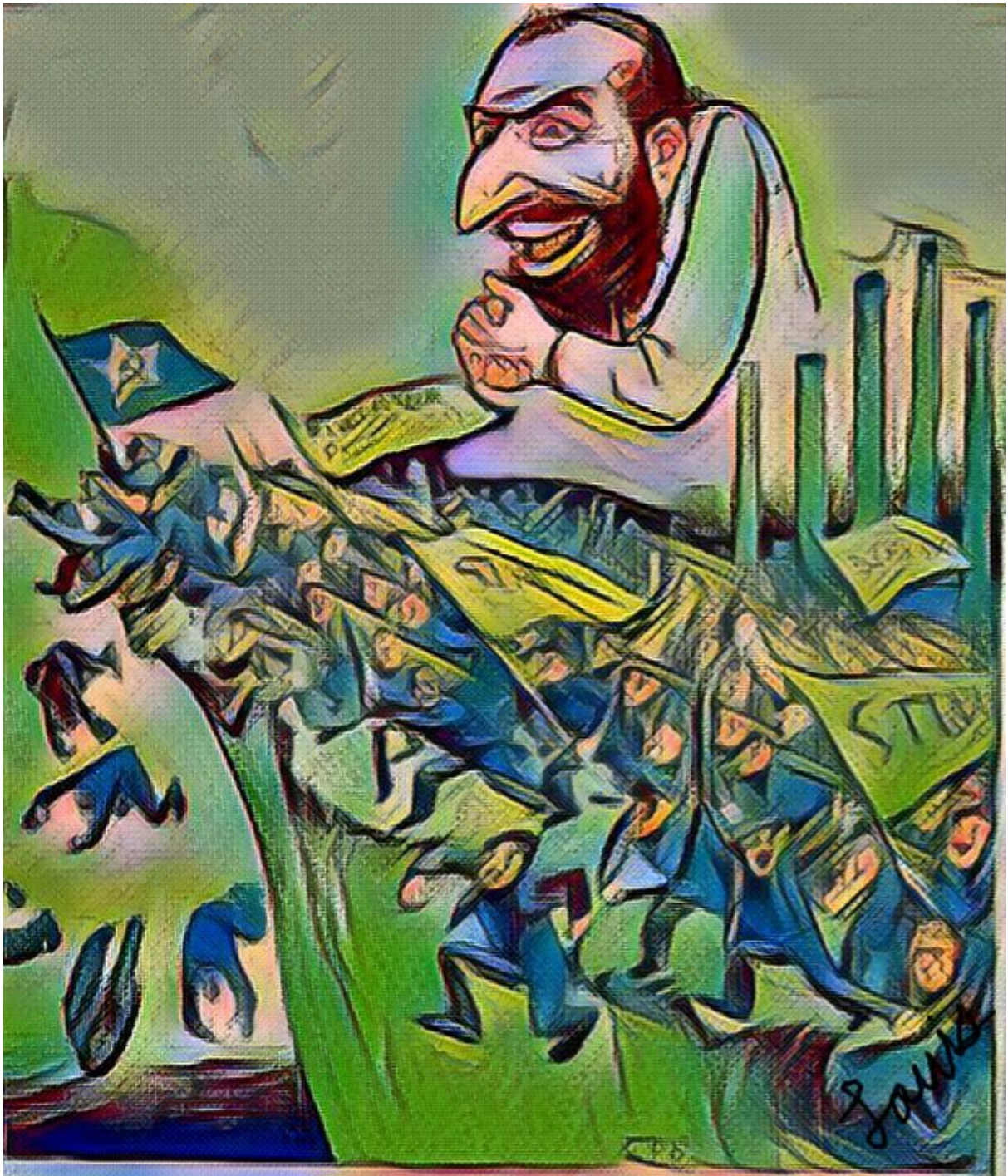
'The Fall of Man' , a modern masterpiece by Louis.