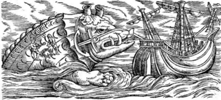
Conrad Gessner, Public Domain

NAVTAE IN DORSA CETORVM, QVAE INSVLAS PYTANT, anchoras figentes saepe periclitantur. Hos cetos Troialua sua lingua appellant, Germanicè Teiiffelwal.