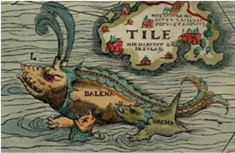
Olaus Magnus, Public Domain

That said, most of the pictures Melville mentions in this chapter aren't that objectionable. The fantastical sea-serpents are at least kind of cute, with their grumpy expressions, frilled collars, and Shrek-like ears/horns/blowholes that spout water in all directions. The scientific illustrators can be forgiven for inaccurately depicting models who were in the process of rotting away. Harris seems to have solved this problem by depicting his whales partially submerged, with only their humped backs showing about the waterline. Sibbald's illustrations are bloated and misshapen, but capture the form of the whale fairly well and aren't that offensive. Colnett's sketch is almost perfect, aside from the scale. Only Cuvier's whale—whose smug grin and erect phallus (probably) grace the cover of this present volume—is as ugly as Melville makes it out to be.